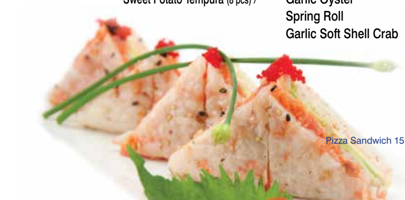
Pizza Sandwich 15