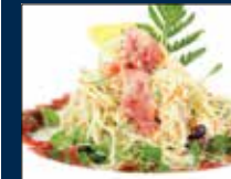
King Crab Mango Salad 15