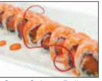
Crazy Salmon Roll 12