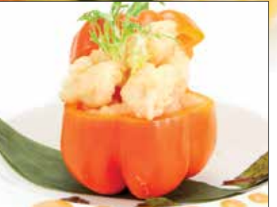
Rock Shrimp Tempura 10