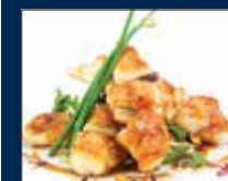
Yakitori (2pcs) 5