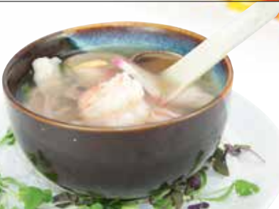
Seafood Soup 6