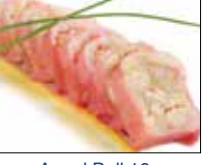
Angel Roll 16