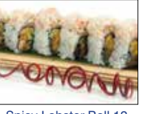
Spicy Lobster Roll 12