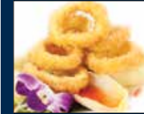
Ika Calamari 8