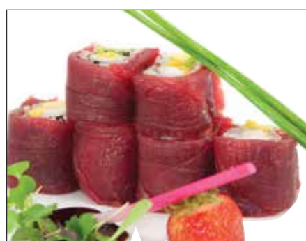
Mars Roll 14