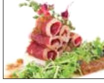
Tuna Tataki Salad 12