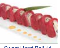
Sweet Heart Roll 14