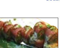
Wasabi Tuna Roll $17