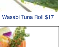
Prince Roll 14