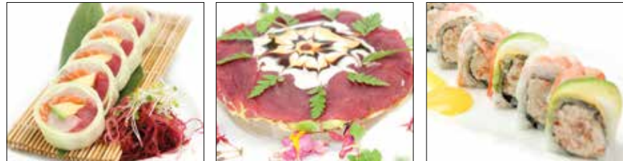
Rainbow Naruto 12