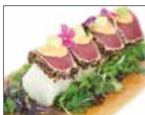
Howie Special 12