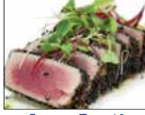
Sesame Tuna 12