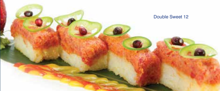
Double Sweet 12

* Consuming raw or undercooked meats, poultry, seafood, shellfish, or egg may increase your risk of foodborne illness, especially if you have certain medical conditions