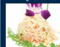
Kani Salad 6