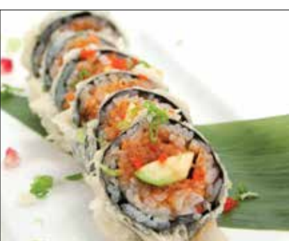
Godzilla Roll 8