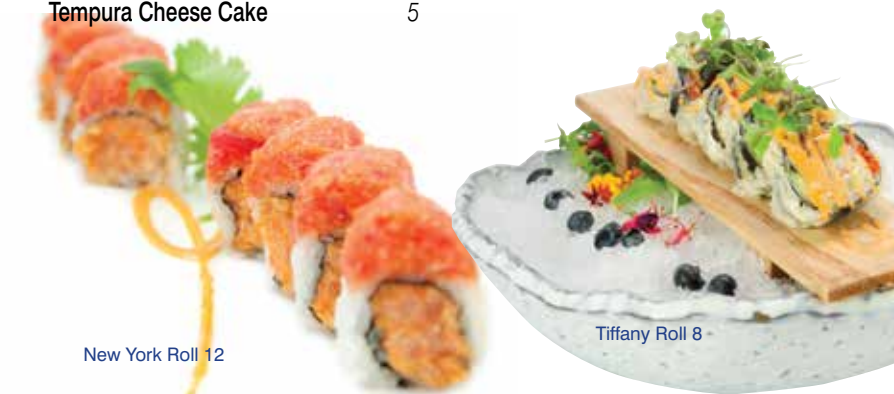
New York Roll 12