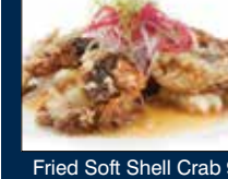
Fried Soft Shell Crab 9