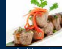
Beef Negimaki 8