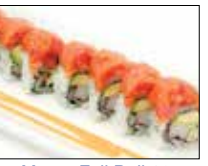
Mount Fuji Roll 10