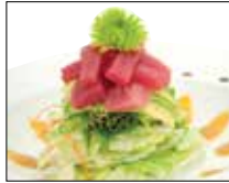
Carly Salad 12