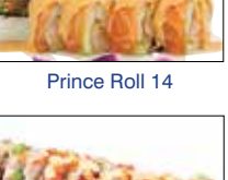
2011 Roll 16