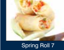
Spring Roll 7