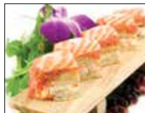
Eggplant Sandwich 12