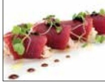
Lobster Chala Ca 12