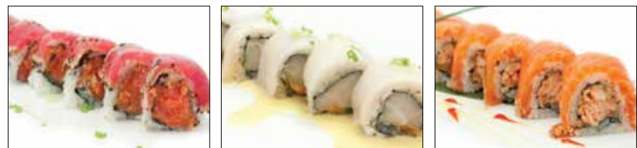
Crzay Tuna Roll 13